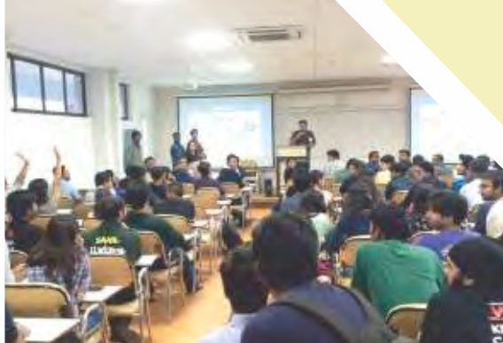
Symbihaat -35 teams battling it out for 12 coveted stalls - Entrepreneurship Summit 2016