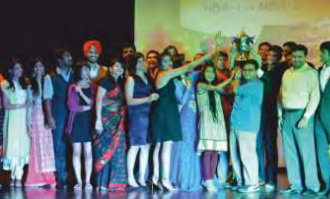
Colosseum 2016- A management and cultural event at SIBM, Pune